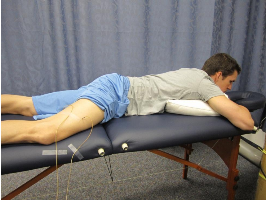
Figure 1. Lying position for insertion of thermistors into ST and VL.